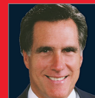
Mitt Romney Former Governor