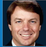
John Edwards Former Senator