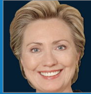
Hillary Clinton Senator