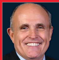
Rudy Giuliani Former Mayor