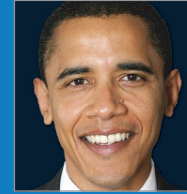
Barack Obama Senator