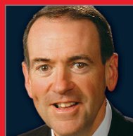
Mike Huckabee Former Governor